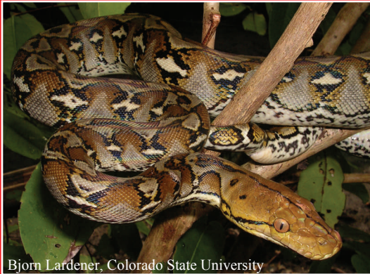
Bjorn Lardener, Colorado State University

14 to 18 ft. Distinct reddish eyes; tan body with dark brown net-like markings with yellow and white accents