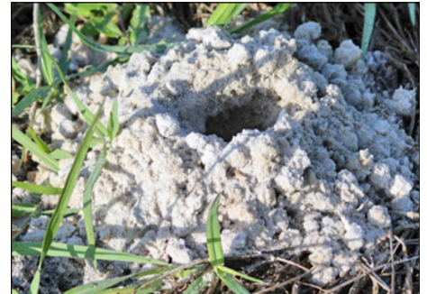
Sand “chimneys” are signs a Crayfish has burrowed down to find moisture.