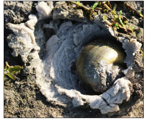
An Apple Snail burrows into the sand

The second (fancy word: non-autolytic ) occurs when the plant defends itself against stress or injury caused by pathogens (viruses, bacteria, fungi) or sucking insects. Cells surrounding the pathogen die to create a barrier protecting healthy cells. One visible sign of this type of apoptosis is the brown and yellowish circles on plant leaves that surround and isolate the infection or injury.