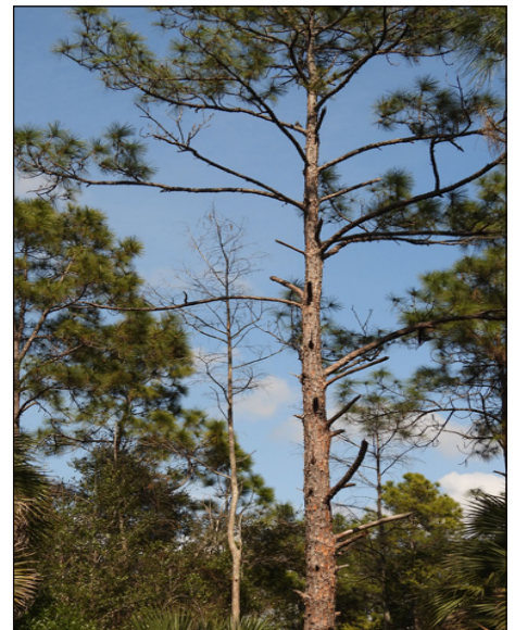
Autolytic : Needles, leaves, low branches die