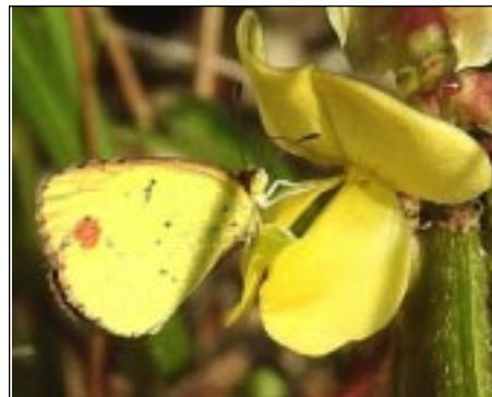
Little Yellow Pyrisitia lisa