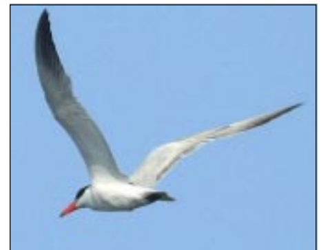
Caspian Tern Hydroprogne caspia